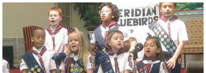
The Adventurers were in charge of the entire worship service.

The worship message was in song and included six songs. The children worked hard. They practiced their songs for more