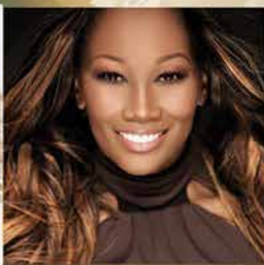
YOLANDA ADAMS | MAY 29