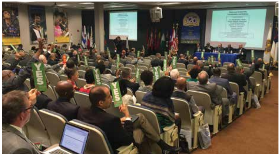
Constituency members vote changes to the constitution and bylaws.