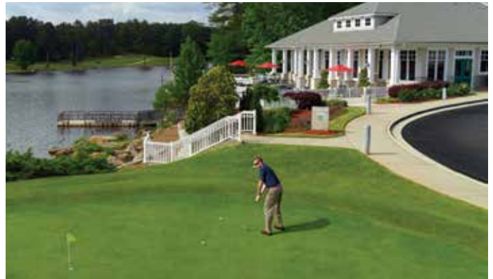
There are two 18-hole golf courses at Stone Mountain Park; one is five minutes from the convention hotel.

spirituality at Southern Adventist University, will also be featured during the weekend. During his 34 years in pastoral ministry, he has served as senior pastor on three university campuses.