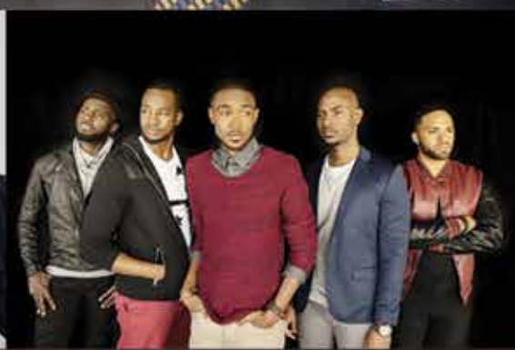
COMMITTED JUNE 8

OAKWOOD UNIVERSITY CHURCH 5500 ADVENTIST BLVD., HUNTSVILLE, ALABAMA