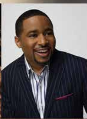
SMOKIE NORFUL | JUNE 3