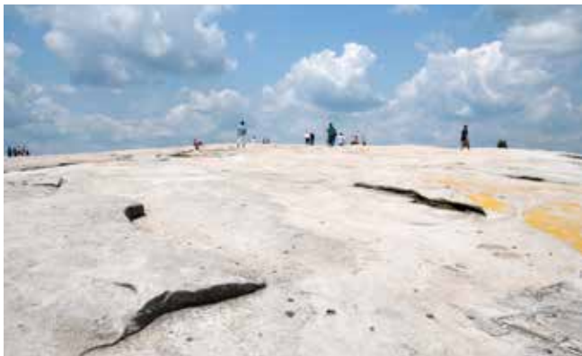
Stone Mountain Park features 15 miles of hiking and walking trails, including the one-mile trail to the top of the mountain.