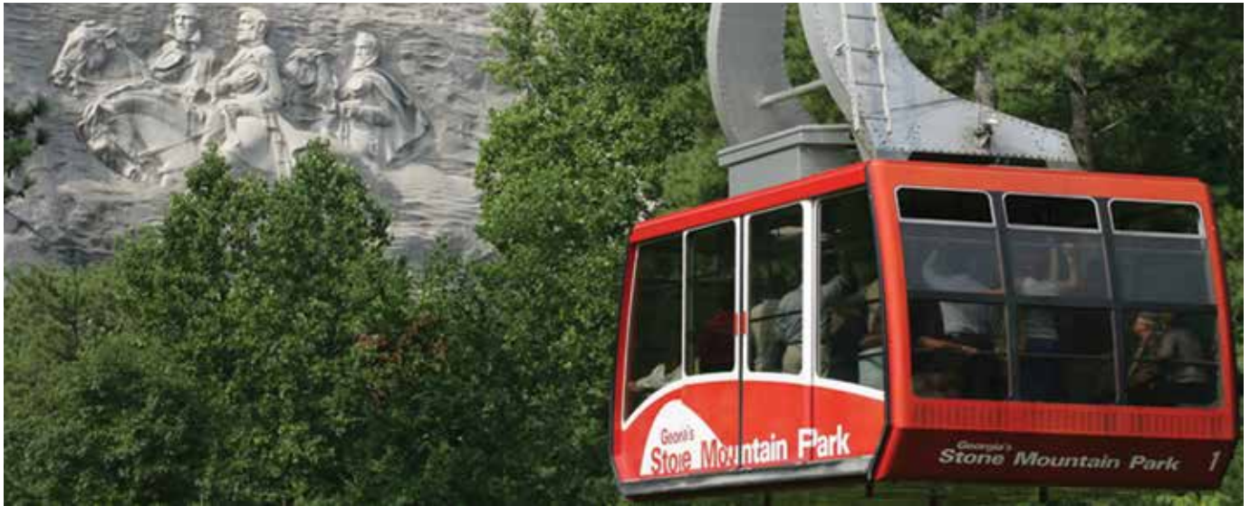
The Summit Skyride at Stone Mountain Park