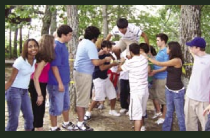
Georgia-Cumberland Academy seniors participate in a team building activity during a senior retreat at Cloudland Canyon.

building restrooms were completely renovated over the summer. In addition, the courtyard (an outdoor area between classroom buildings) was redesigned and renovated. Funds for the courtyard project came from alumni donations and part of the proceeds from the annual golf tournament.