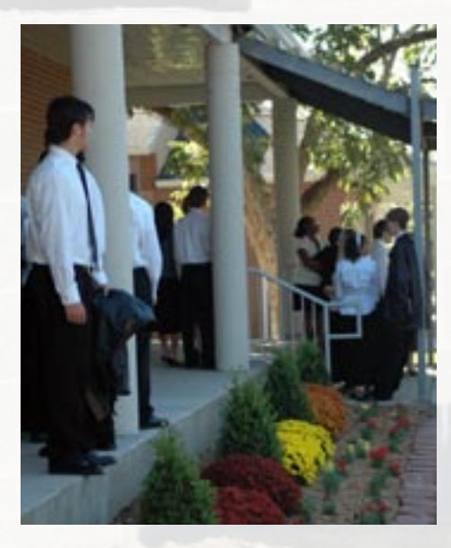
Band and choir members wait outside the new music building before their concert Sabbath morning.