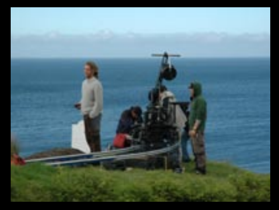
Secret of the Cave crewmembers set up for a shot at the top of a seaside cliff on Achill Island.

"After seeing the other films, it made me realize what an honor it was to be included in the same group,"