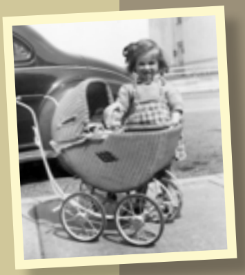
Carrol was raised in upstate New York