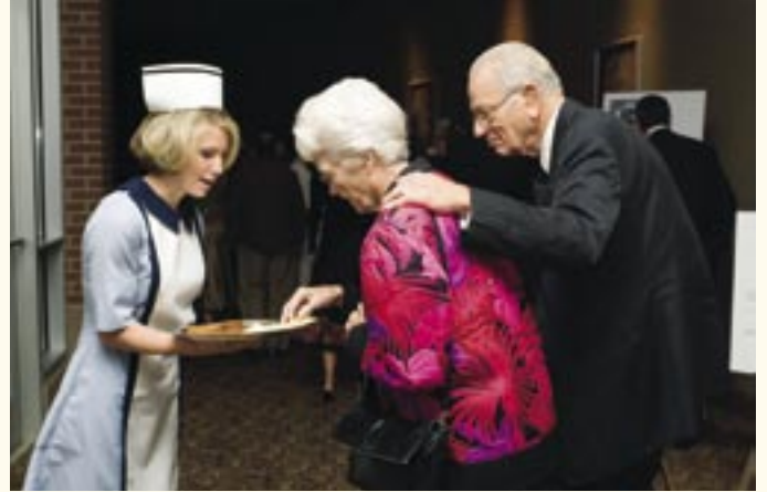
Nursing students wore historical nursing uniforms while serving guests at the Celebration of Nursing gala.