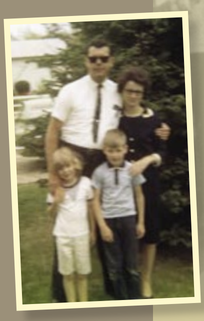
Growing up on Long Island