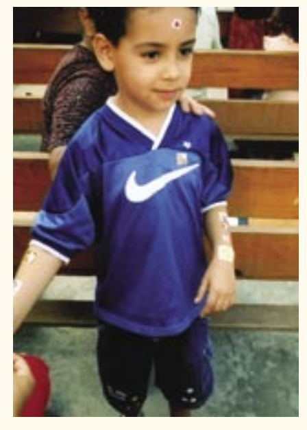
Children were delighted with the gift packets prepared by Dunlap church members. This little boy wore his stickers to church!

The Dunlap members lived with the family of the head elder and formed close relationships with the Honduran church members