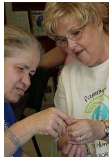
Creating crafts was a highlight of the day.