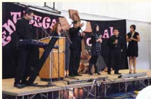
SUBMITTED BY MIGUEL TIRADO