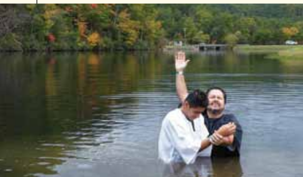
SUBMITTED BY MIGUEL TIRADO