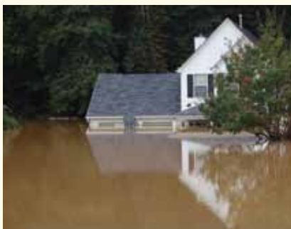
SUBMITTED BY TABOR NUDD

Lakeview scheduled several Sundays as work