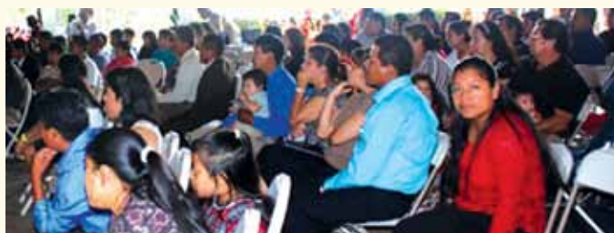
The attendees enjoyed inspirational sermons, beautiful music, and Christian fellowship.

children's program with the theme: "Crowns and Castles." The children were blessed with Christian praise songs, DVD's, activities, and lessons.