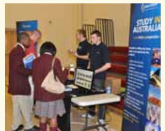
Students from GAAA and AAA receive information from one of the college recruiters.