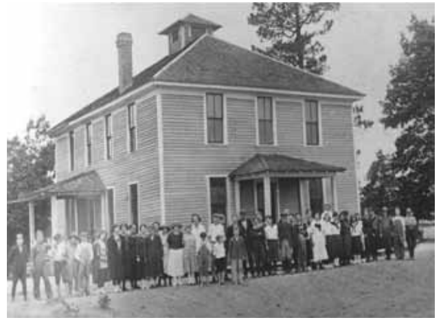
Douglasville, Georgia, school and church

tist school. The church was renovated where they partitioned the auditorium into rooms for the school and added a second floor for the church itself.