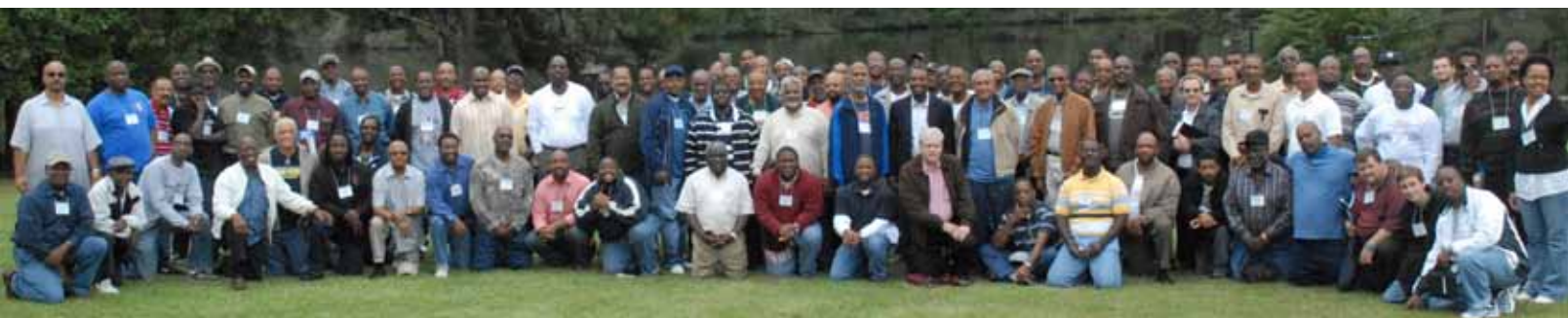
Smiling men — exhilarated and rejuvenated — were ready to go home and tell the story to bring back 1,000 men or more next year.