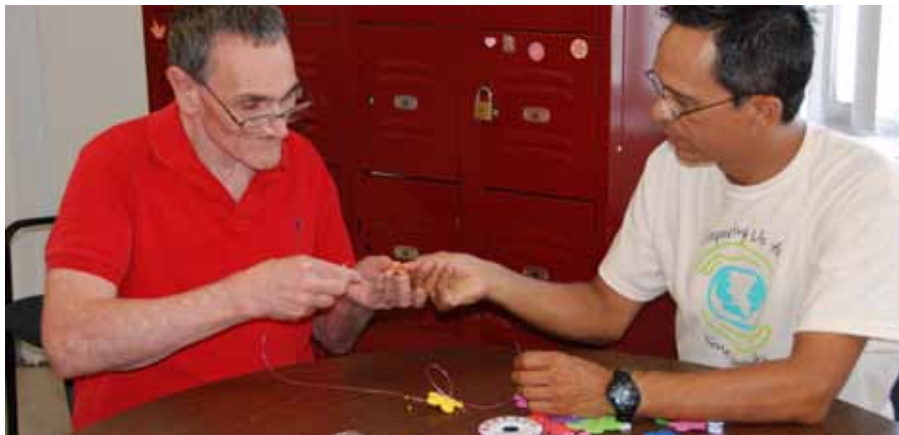
The craft room was a great place for engaging activities and interaction.

Florida Hospital College of Health Sciences Commitment: We will live Healthcare as Ministry using our hands to do God's work, to exceed expectations, to help even if the problem is not ours, to believe in spite of doubts, and to serve with joy. Our commitment is more than words, so we will now go and do likewise .