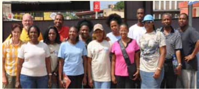
Members of the 2009 ShareHim Ghana Crusade

one speaker encountered a group of older men playing checkers. After complimenting the winner, the speaker handed the players a Steps to Christ and invited them to the night's service. As the service began, however, the speaker didn't see any of the players. The message was entitled, "How to Start Life Over – Baptism." When delivering the appeal, the winner of the game responded to the call and gave his life to the Lord. The speaker praised the Lord for His marvelous works. During another night's ap-