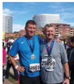
SUBMITTED BY RICK GREVE