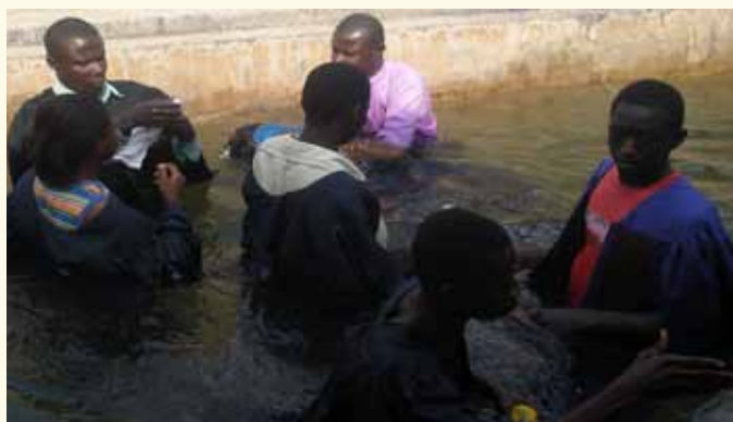
Pastors baptize three individuals on July 25. A total of 177 individuals were baptized at the completion of the crusade.

As the team members performed community outreach, many of the residents asked for a home visit from the speakers. During one such visit,