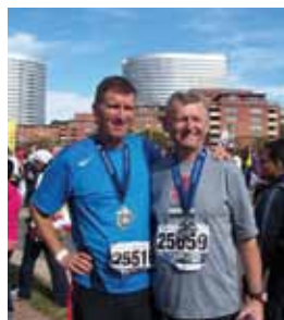
SUBMITTED BY RICK GREVE