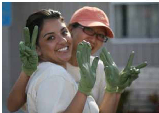
Taking a break, new friendships were formed and memories made.