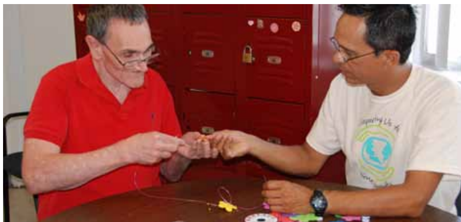
The craft room was a great place for engaging activities and interaction.

Florida Hospital College of Health Sciences Commitment: We will live Healthcare as Ministry using our hands to do God's work, to exceed expectations, to help even if the problem is not ours, to believe in spite of doubts, and to serve with joy. Our commitment is more than words, so we will now go and do likewise .