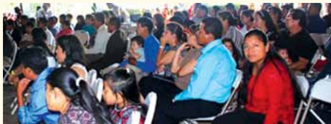
The attendees enjoyed inspirational sermons, beautiful music, and Christian fellowship.

children's program with the theme: "Crowns and Castles." The children were blessed with Christian praise songs, DVD's, activities, and lessons.