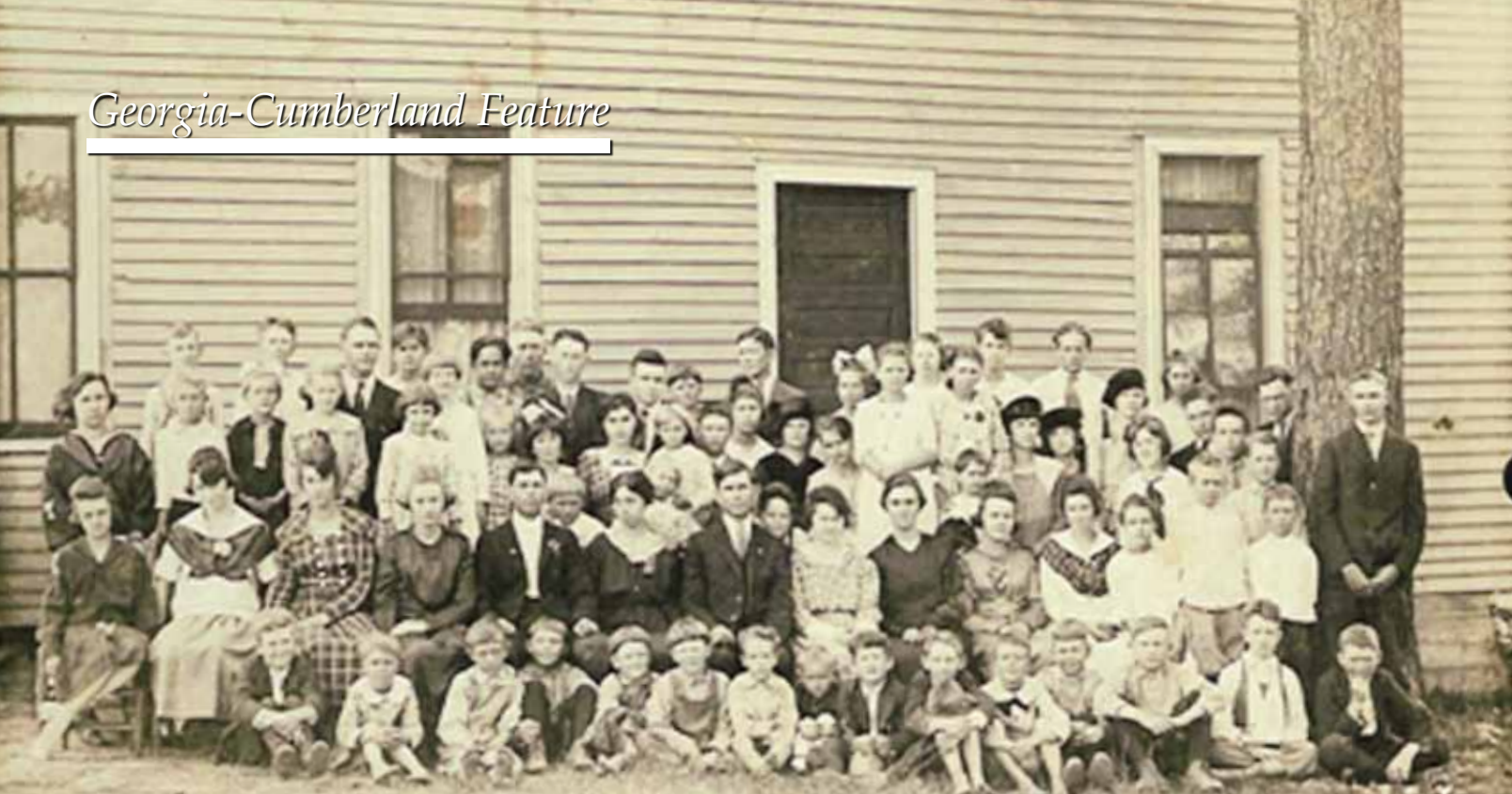
Flat Rock school