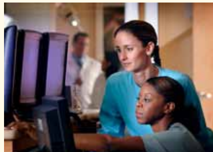
Infection and mortality rates, as well as patient feedback, are available on hospital websites.

Transparency such as this is expected to make dramatic improvements in the ever-changing world of healthcare. Florida Hospital is committed to adapt to change and meet the emotional, spiritual, and physical needs of its patients.