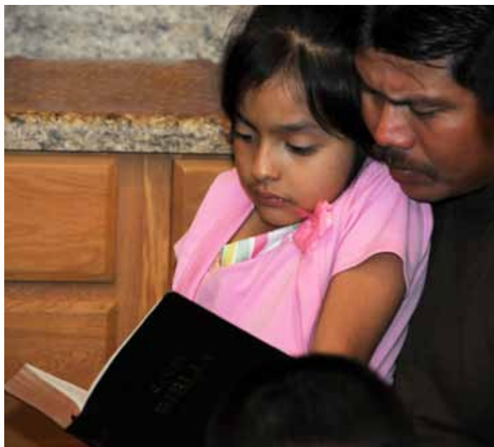
Father and daughter intently follow along in the Bible at the meetings in Greenwood, South Carolina.

The Bethel French Church had several baptisms that final Friday night of the meetings. To God we give all the praise.