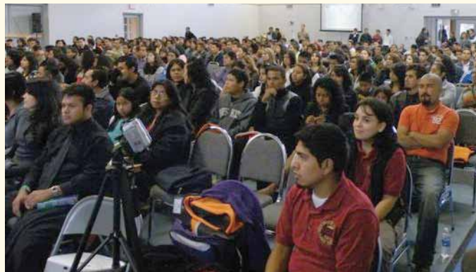
SUBMITTED BY MIGUEL TIRADO