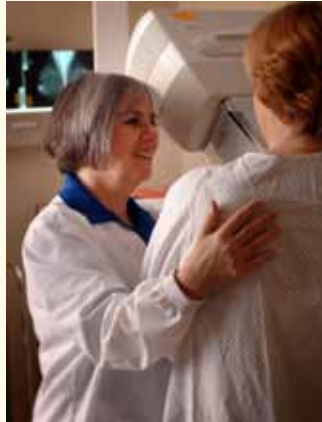
Takoma Regional Hospital is committed to providing patients with the best care.

Similar to digital photography, this new system offers the highest resolution currently available. Higher