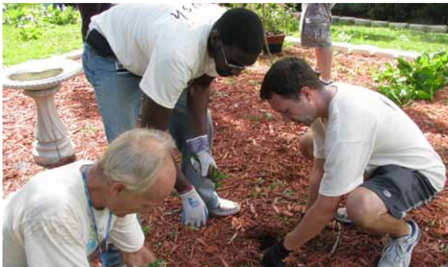
Many Florida Hospital College volunteers worked together to beautify the grounds.