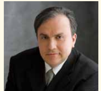
Grammy award-winning pianist Yefim Bronfman helped Southern celebrate its new distinction as an All-Steinway School.