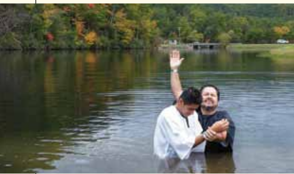
SUBMITTED BY MIGUEL TIRADO