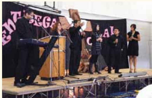
SUBMITTED BY MIGUEL TIRADO