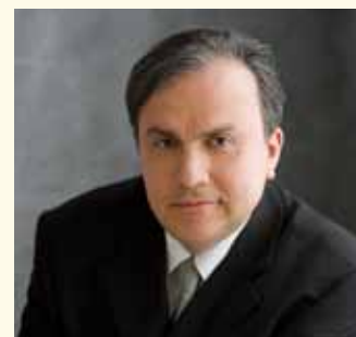
Grammy award-winning pianist Yefim Bronfman helped Southern celebrate its new distinction as an All-Steinway School.