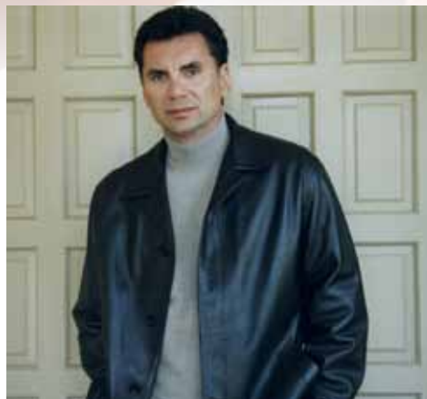
Former mob boss Don Michael Franzese spoke at the 2008 Prayer Breakfast sponsored by Gordon Hospital. His story riveted the crowd as he told how God lifted him from despair and turned him into a new man.

"A couple of years ago, we had to change the venue because we