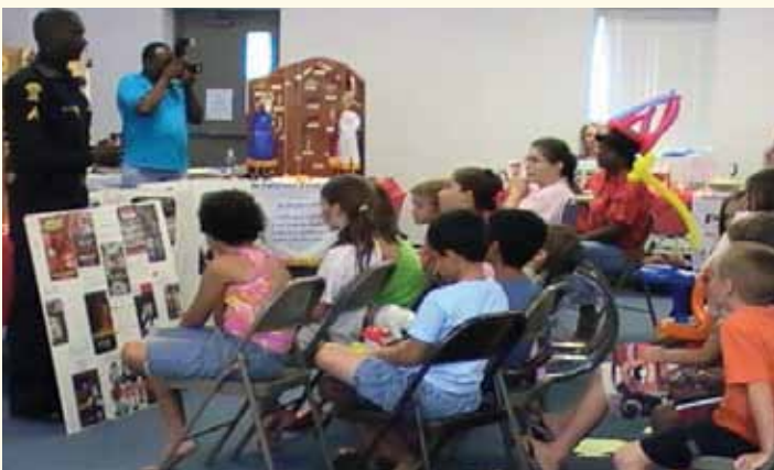
The Panama City Police Department provided education on drug awareness and child and Internet safety.

CHIP programs were also highlighted. There were a number of games, lots of food, and loads of fun, which encouraged family togetherness and interaction.