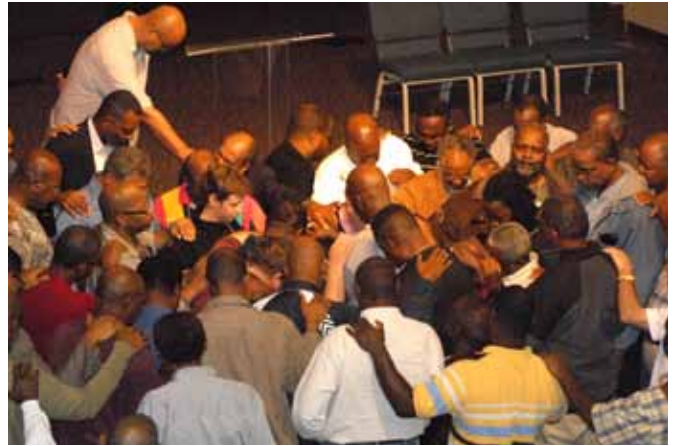
This was a spiritually charged moment when all the men's hearts were focused on one individual's need. All were drawn near in support of a hurting brother. Everyone at that moment offered intercessory prayers for him.