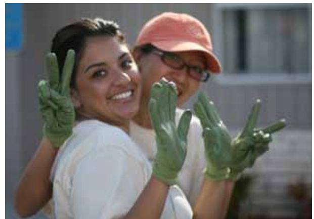
Taking a break, new friendships were formed and memories made.