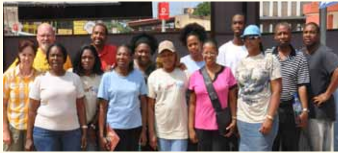
Members of the 2009 ShareHim Ghana Crusade

one speaker encountered a group of older men playing checkers. After complimenting the winner, the speaker handed the players a Steps to Christ and invited them to the night's service. As the service began, however, the speaker didn't see any of the players. The message was entitled, "How to Start Life Over – Baptism." When delivering the appeal, the winner of the game responded to the call and gave his life to the Lord. The speaker praised the Lord for His marvelous works. During another night's ap-