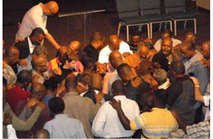
This was a spiritually charged moment when all the men's hearts were focused on one individual's need. All were drawn near in support of a hurting brother. Everyone at that moment offered intercessory prayers for him.