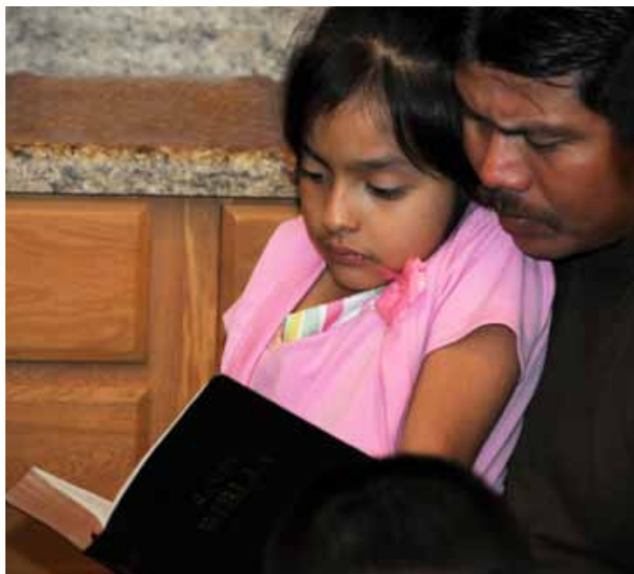
Father and daughter intently follow along in the Bible at the meetings in Greenwood, South Carolina.

The Bethel French Church had several baptisms that final Friday night of the meetings. To God we give all the praise.