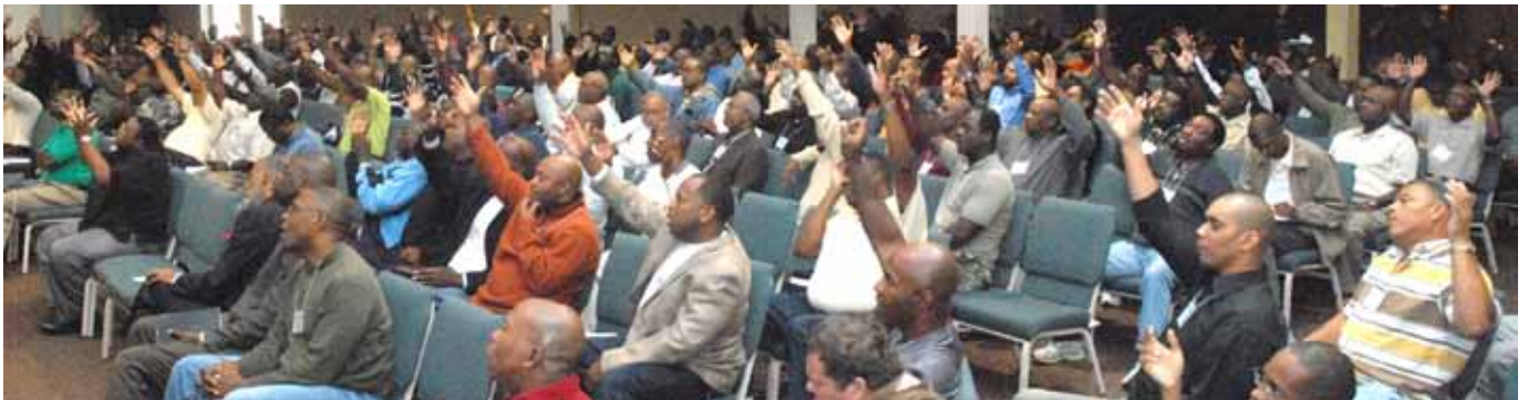
More than 250 men worshipped, sang, and prayed together.