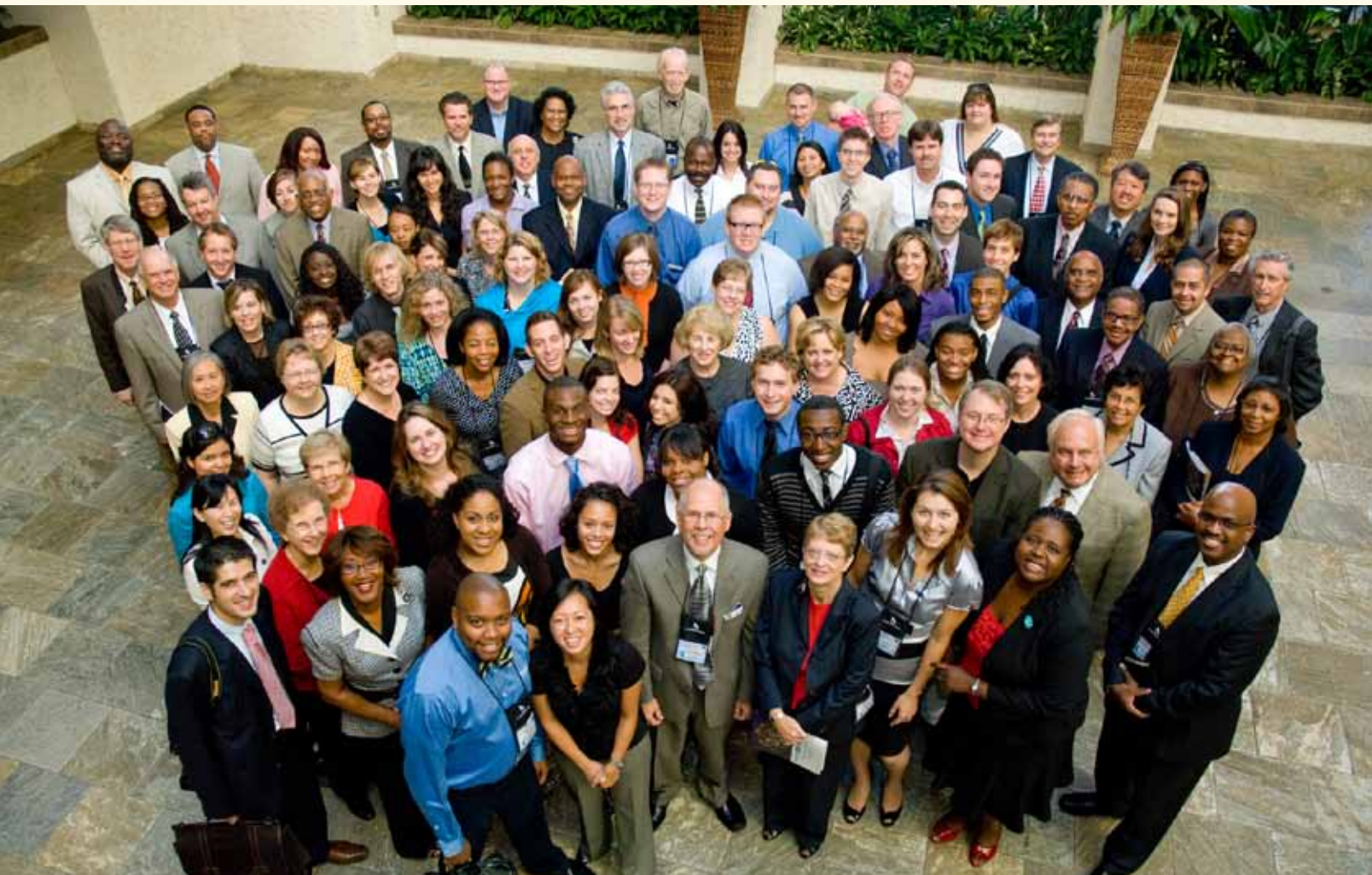
SAC 2009 attendees and presenters

Collaboration. Creativity. Inspiration. This year's Society of Adventist Communicators (SAC) Convention delivered all of this and more. Newport Beach, Calif., proved to be an inspiring backdrop for the 20th annual convention. A total of 140 communicators from across the country joined together to exchange ideas, celebrate successes,