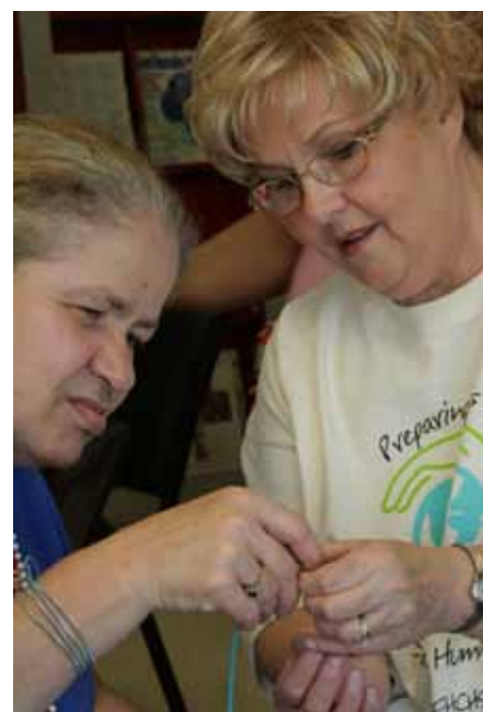
Creating crafts was a highlight of the day.