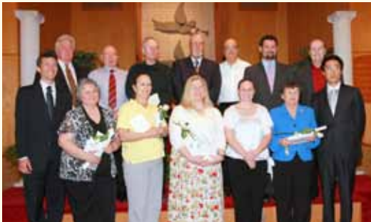
These new members are the first fruits from the Prophecy Seminar.