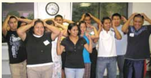
A variety of teaching methods were used in the English classes.