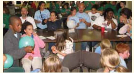
Families enjoyed fellowship with other club families throughout the Conference.