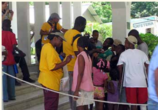
The medical missionaries spend time interacting with the Haitians during their visit.

at the hospital, they were skilled to provide direct physician and nursing care to patients in the emergency room, progressive care unit, and mother/baby facility. The east wing of the hospital, serving as the PACU (Post Anesthesia Care Unit) and ICU (Intensive Care Unit), utilized many of the nurses in the team. On the grounds of the hospital and the university, Universite’ Adventiste d’Haiti, people received distribution bags filled with items of daily care and living, which included toothbrushes, toothpaste, soap, combs, washcloths, and diapers. Volunteer staff meetings were held each morning and evening under the direction of Loma Linda University’s Global Health Institute representative Andrew Haglund. Volunteers worked nearly 12-hour days or nights, and for those volunteers of Haitian decent, the day may have led into almost 14 to 16