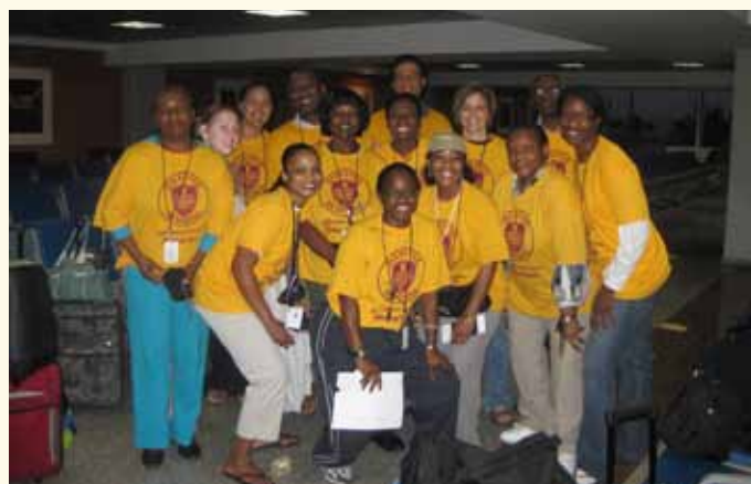
Each one of the group of volunteers had the same testimony: that their view of life has changed forever because of this experience.