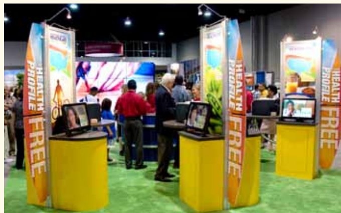
Attendees at the 59th General Conference Session were invited to take a free health assessment. Representatives from Seventh-day Adventist health organizations were available to help and explain their results.