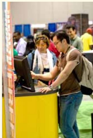
GC attendees learn more about Seventh-day Adventist hospitals in their area through the interactive touch screen tour.