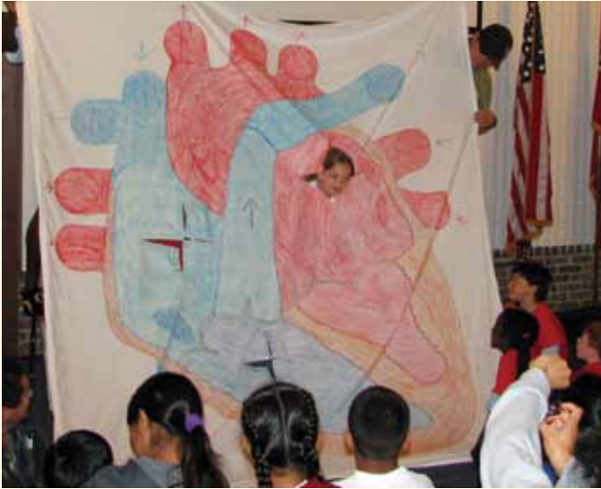
The Adventurers from Decatur, Ala., presented a play of how the blood circulates. The head sticking out of the heart shares what its job is and how it pumps the blood. There were four valves that did the “talking.”

During the weekend of April 22, 2010, Adventurer clubs throughout the Gulf States Conference gathered at Camp Alamisco for the annual Adventurer Family Fun Weekend. Focusing on