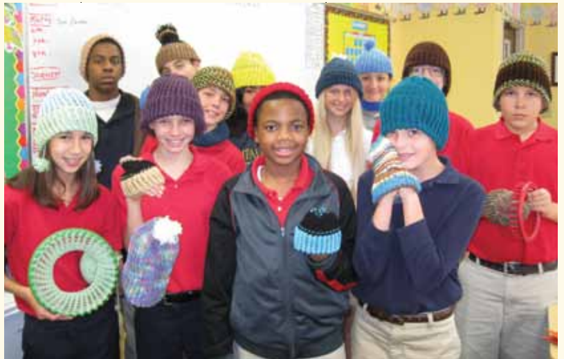
Students model the hats they made for the homeless.