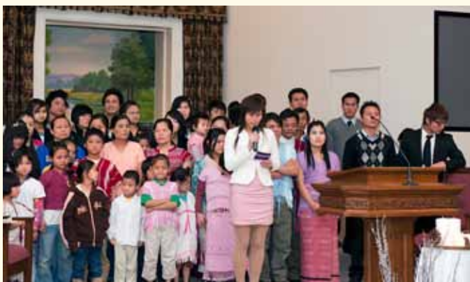
Dressed in their colorful native outfits, the group was invited to the front of the church and officially welcomed.