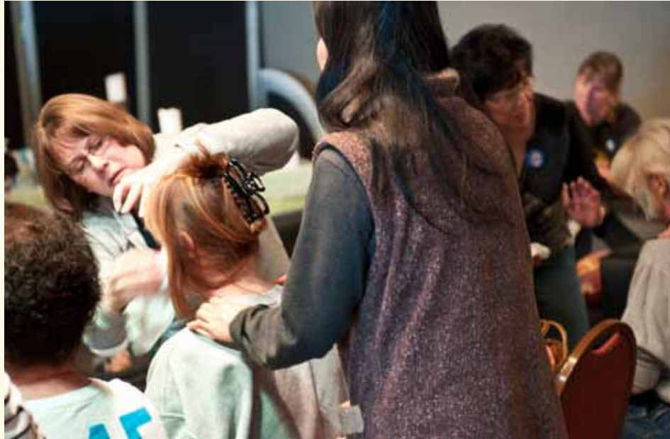
More than 70 women volunteered to serve the Chattanooga, Tenn., community with a “God in Shoes” outreach. Guests were pampered free of charge, offering a spa day with hair styling, manicures, and facials. The event took place the day before the retreat, March 17, 2011.