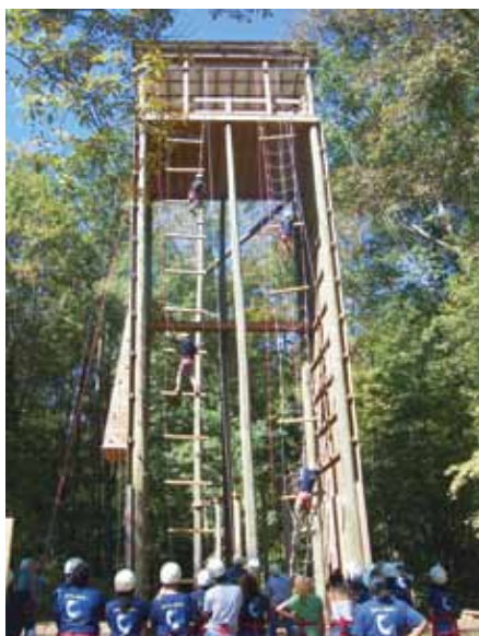
Guests climb rope ladders as part of a team-building activity at the outdoor education center on Southern's campus.