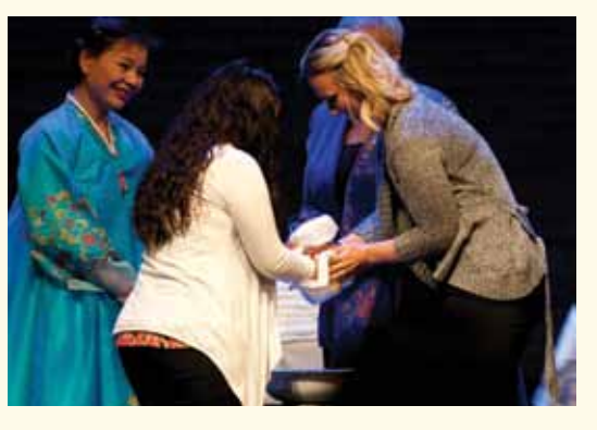
Nursing students wash each other's hands in an act of loving service and humility during nursing convocation.

"As you enter a patient's room, you are standing on