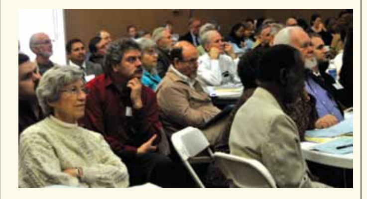
Local church teams listened intently to the thought-provoking presentations.

Institute (NADEI), is an official meeting sponsored by the local conference for pastors and a missionfocused leadership team of 10-12 from each church or district. The training work-