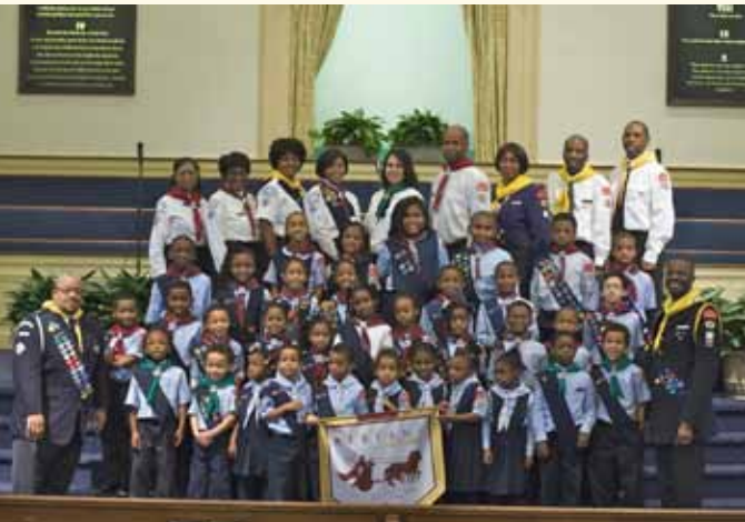
Representatives of Atlanta-Berean Chariots Sabbath School program

During the welcome, all of the Adventurers and staff assisted by handing out ori-