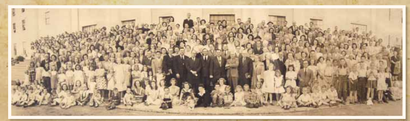
Carolina Conference Camp Meeting in 1947