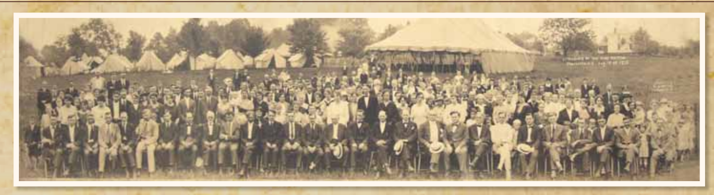
Carolina Conference Camp Meeting in 1920