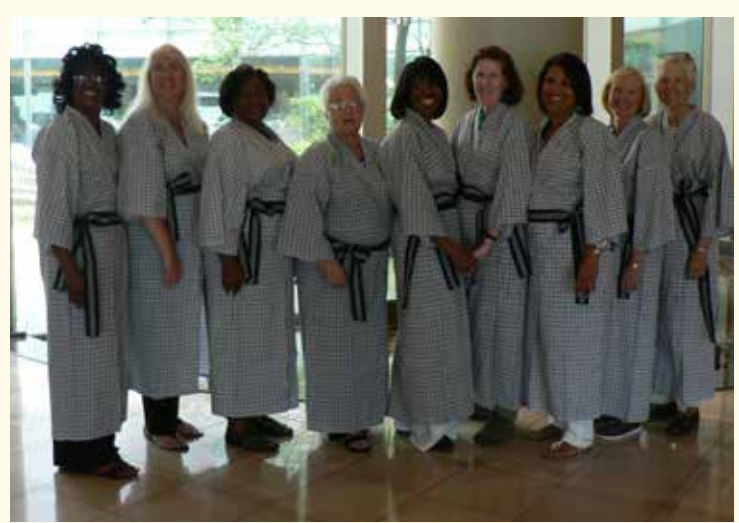
Ministerial spouses in kimonos before leaving Japan.