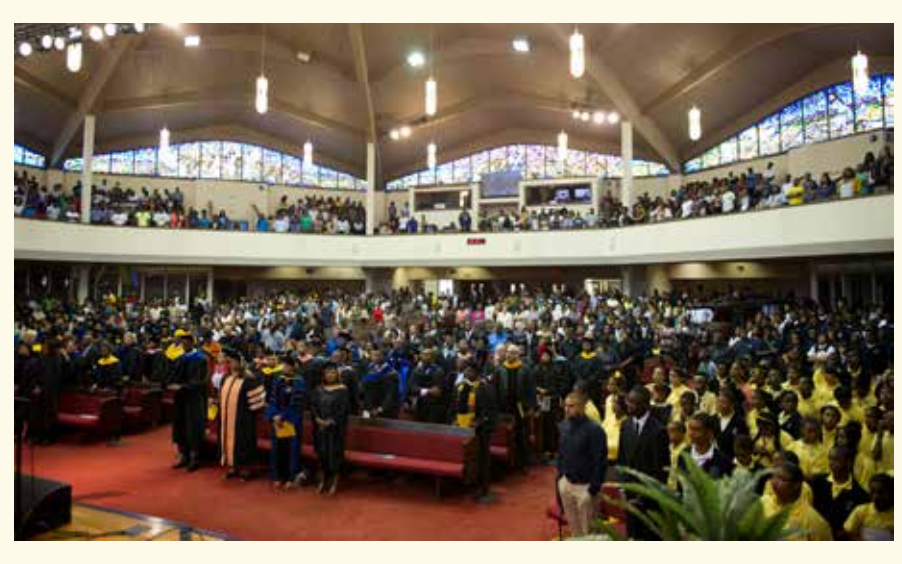
Individuals from Oakwood University community, faculty, and staff, and students from Oakwood Adventist Academy joined in a special dedicatory service at Oakwood University Church in Huntsville, Ala.