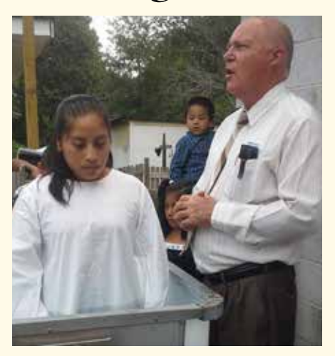
Momento de la ceremonia bautismal

El 26 de Julio la congregación de Saluda, NC, recibió gozosa a un alma más que tomó la decisión de bautizarse y unirse al camino que lleva al Reino de los Cielos.