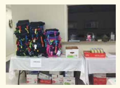
The donated book bags are ready to be filled with school supplies.

the book bags with school supplies and snacks, which