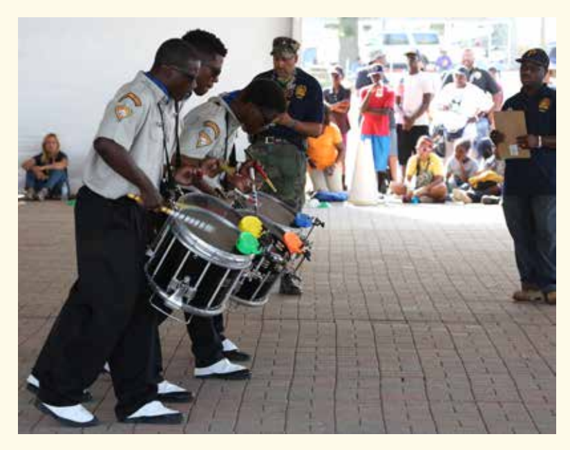
Members of the Shiloh Eagles Pathfinder Drum Corps perform a routine as judges mark the judging rubric. The Eagles received a First Place Award for their performance during the International Camporee Drum Competition in Oshkosh, Wisc.

sion to get baptized before attending the camporee. "I love the Lord. This is a big step for my life," she added.