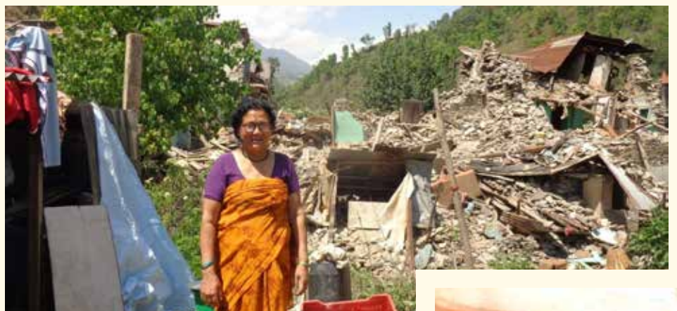
las lecciones de escuela sabática al Nepalí, está altamente comprometido en la tarea de ayuda a quienes han sufrido pérdidas, y agradeció el gesto en nombre de la iglesia Adventista en Nepal.