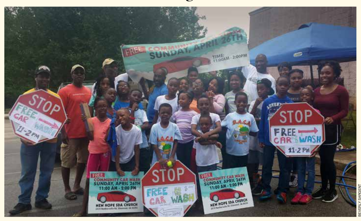
Volunteer members of New Hope Church show their signs used to attract neighbors to the car wash.

Despite the somewhat early retreat of "the yellow curse" (pine pollen) this April, a car wash is always welcome at spring time in Georgia, and even more so, a free one. On Sunday, April 26, 2015, a car wash, free of charge, was carefully planned and held on the grounds of New Hope Church in Ellenwood, Ga. This was a collaborative effort among several departments spearheaded by the deacon's and the personal ministries departments, working with the hospitality team and the New Hope Panther's Cubs