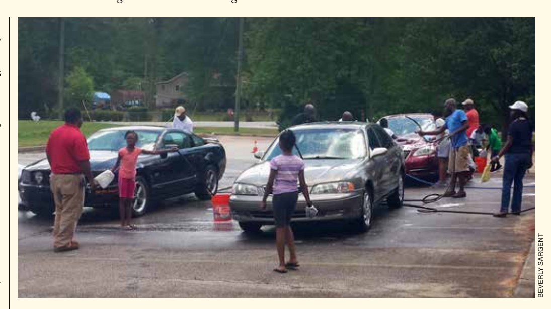
New Hope youth, parents, and department leaders unite to wash vehicles for community neighbors free of charge.

Despite the somewhat early retreat of "the yellow curse" (pine pollen) this April, a car wash is always welcome at spring time in Georgia, and even more so, a free one. On Sunday, April 26, 2015, a car wash, free of charge, was carefully planned and held on the grounds of New Hope Church in Ellenwood, Ga. This was a collaborative effort among several departments spearheaded by the deacon's and the personal ministries departments, working with the hospitality team and the New Hope Panther's Cubs