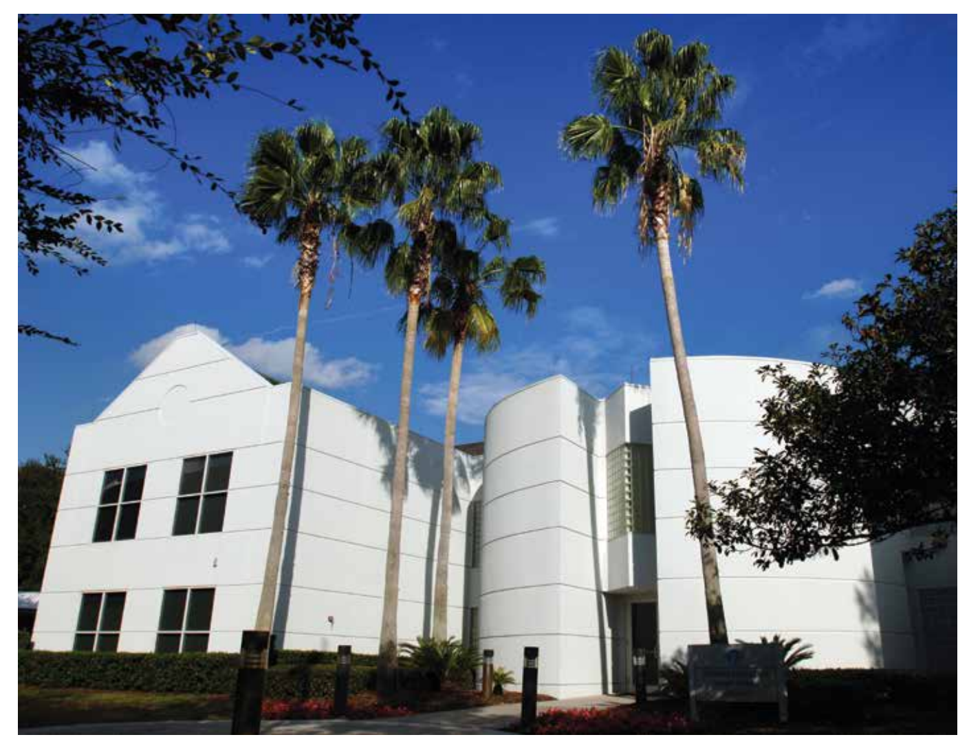
ADU's General Education Building, converted from the old Florida Hospital Seventh-day Adventist Church

students to optimize their course selection based on their future professional goals.