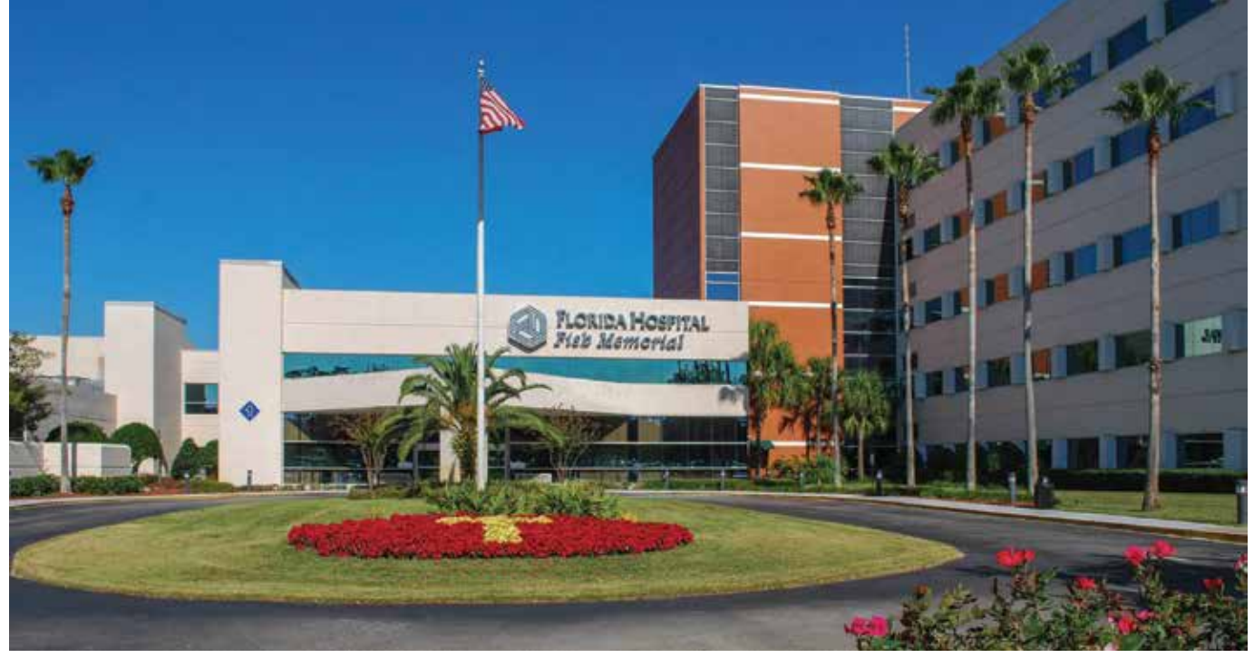
Florida Hospital Fish Memorial has received the Bronze Award from the U.S. Department of Health and Human Services' Health Resources and Services Administration (HRSA) for their efforts in encouraging enrollment in Florida's organ donor registries.

lorida Hospital Fish Memorial has received the Bronze Award from the U.S. Department of Health and Human Services' Health Resources and Services Administration (HRSA) for their efforts in encouraging enrollment in Florida's organ donor registries.