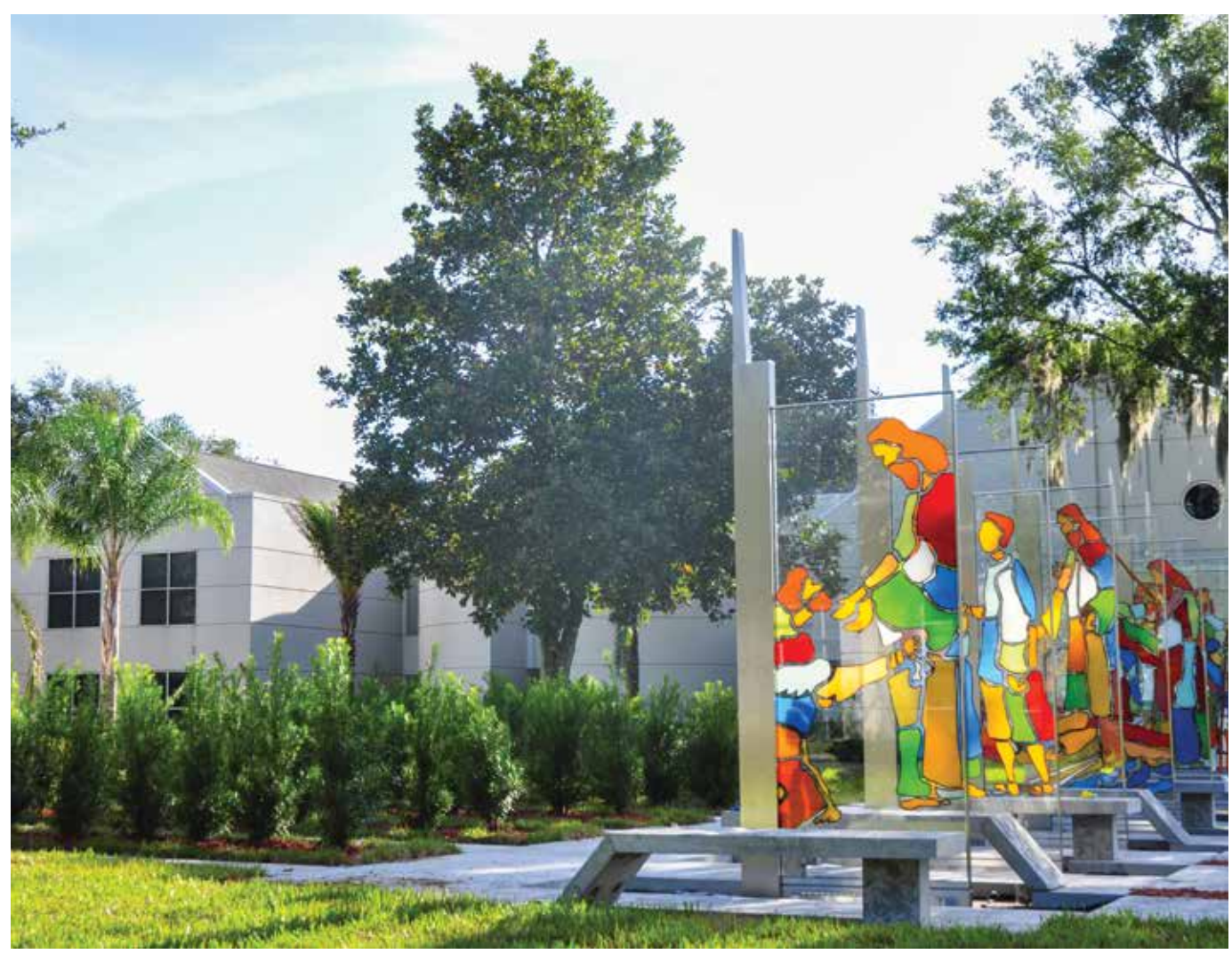
The Garden of Miracles, a daily visual reminder of ADU's mission

ow hospital chaplains during their rounds and learn from first-hand experience. This direct contact has allowed students to engage on a personal level with patients, not just as professionals — all with the goal of reinforcing ADU's ethos of living the healing values of Christ.