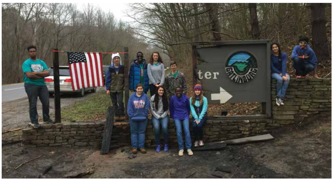
The ninth- and tenth-grade students from Greeneville Adventist Academy in Greeneville, Tenn., provided aid two times to those impacted by the fires in Gatlinburg, Tenn.

he ninth- and tenth-grade students of Greeneville Adventist Academy in Greeneville, Tenn., played an active role in the restoration of the fire-ravaged Gatlinburg, Tenn.