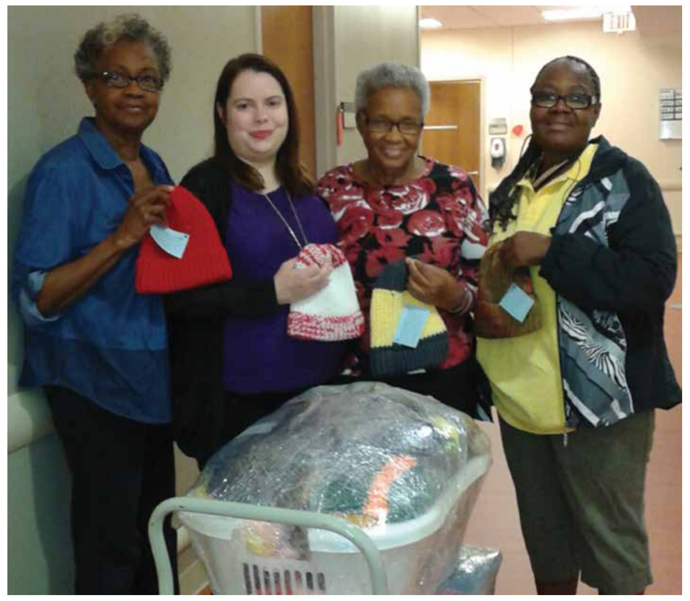
The women at Progress Village Church deliver handmade hats to the Moffitt Bone Marrow Transplant Clinic in Tampa, Fla.

he women of Progress Village Church in Tampa, Fla., are always busy, thanks to Opal Lattimore.