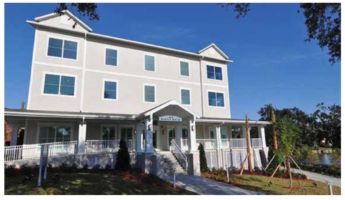
The Bartch Transplant House features 24 private rooms, a kitchen, laundry facility, and common spaces for families of transplant patients.

lorida Hospital leaders are excited to announce the opening of the Bartch Transplant House, a new home at the Orlando campus that will provide crucial services to transplant patients and their families.