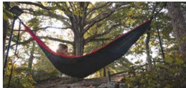
Trees are a prominent part of Southern's campus; now, in addition to providing shade and beauty, they will also contribute to learning.