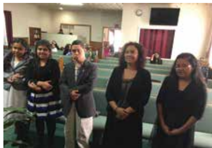
Grupo de candidatos de bautismo