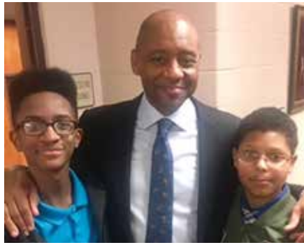
Two GMAA students are pictured with the famous African-American saxophonist, Branford Marsalis (center).

Research has found that learning music facilitates learning other subjects, and enhances skills that children inevitably use in other areas. Playing an instrument in an ensemble is a fun group activity that enhances social and spiritual development.