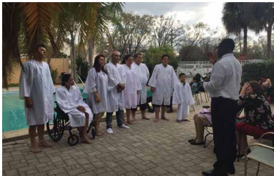
Grupo de candidatos de bautismo antes de la ceremonia

El viernes 23 de febrero 10 personas se graduaron del curso “La Fe de Jesús.” Por la gracia de Dios, 7 de ellas tomaron la decisión de bautismo, y junto a otra persona que ya había estado tomando estudios bíblicos, se bautizaron el sábado 24. Este grupo pertenecerá a la nueva congregación que está en el proceso de organización, que se llamará Tampa Bay Renacer. La feligresía que trabaja en el proceso de plantar esta nueva iglesia está animada, y feliz de ver los primeros frutos de su trabajo.