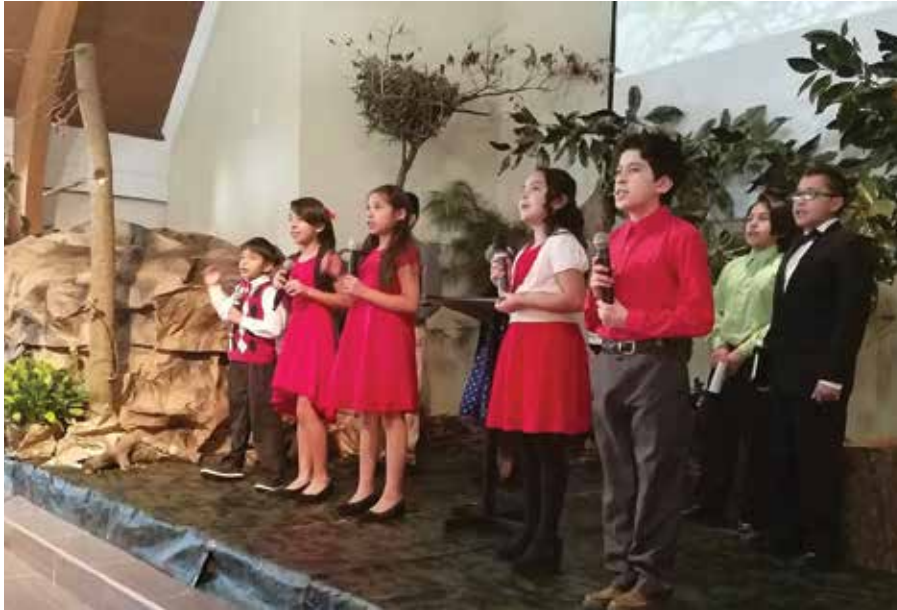
Pequeños participantes de un gran evento

Desde el sábado 2 hasta el 9 de diciembre los niños de la iglesia hispana de Mableton lanzaron un programa de evangelismo titulado “En la Casa de mi Padre”. Cada noche fueron los protagonistas del programa. Oraban con gran entusiasmo, dirigirían las alabanzas y uno de ellos presentaba el mensaje con una aplicación inspiradora y apropiada. Fue emocionante verlos activos participando de la misión de la iglesia de ir y predicar el Evangelio.