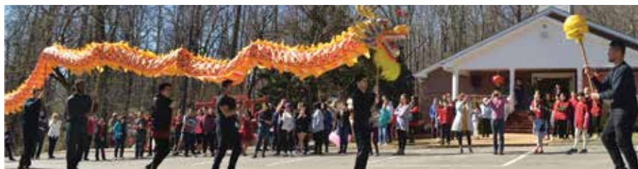
Desfile chino típico