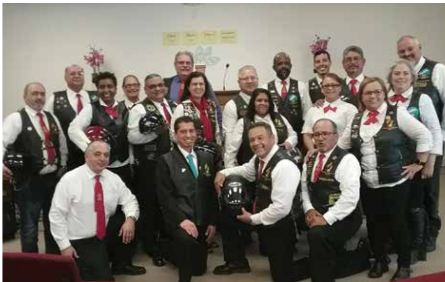
Grupo de motociclistas