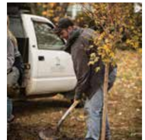
Last year Southern added 125 new trees and shrubs in honor of its 125th anniversary.

sive trail system as well. Along the trails in Fenton Forest, the team will tag trees with QR codes that are slightly different than those in the center of campus. By scanning the code, the user will be prompted to guess the species of the upcoming tree; the answer will be revealed on that tree, creating a fun, interactive activity that anyone can take part in.