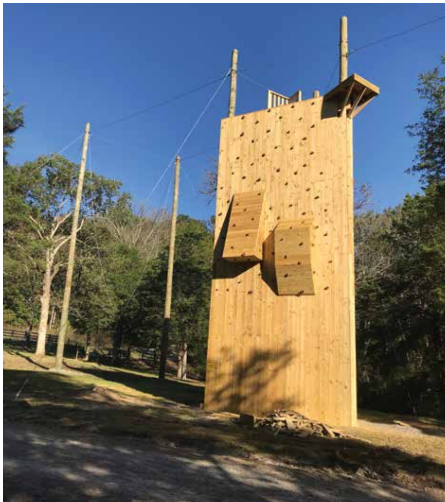
New Indian Creek Camp climbing wall