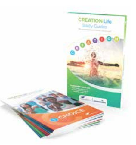
A partnership between AdventHealth and It Is Written, the CREATION Life Study Guides feature eight Bible-based studies for achieving optimal health.

Over the years, AdventHealth has developed an array of whole-person health materials that's been used by a variety of institutions, congregations, and ministries. When AdventHealth got the call for