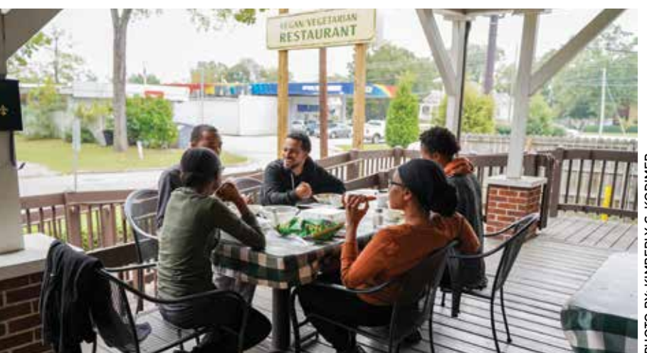
Country Life Natural Food Store and Vegan/Vegetarian Restaurant in Columbus, Ga., started 50 years ago. They offer a wide variety of food options, and a 55-item salad bar. In 2018 they served 35,000 meals.

Throughout its history, Country Life has served the community through various public