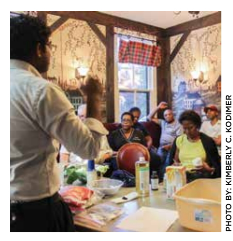
Country Life serves the community through a variey of public programs, including Lunch n' Learn and Dinner with the Doctor. County Life serves about 1,000 people per week, and was named by local residents as the city's "Best Health Food Store" and "Best Health Food Restaurant" for multiple years.

programs, including Lunch n' Learn, Dinner with the Doctor, a screening of Forks Over Knives, and participation in city government health fairs. Country Life also offers a large