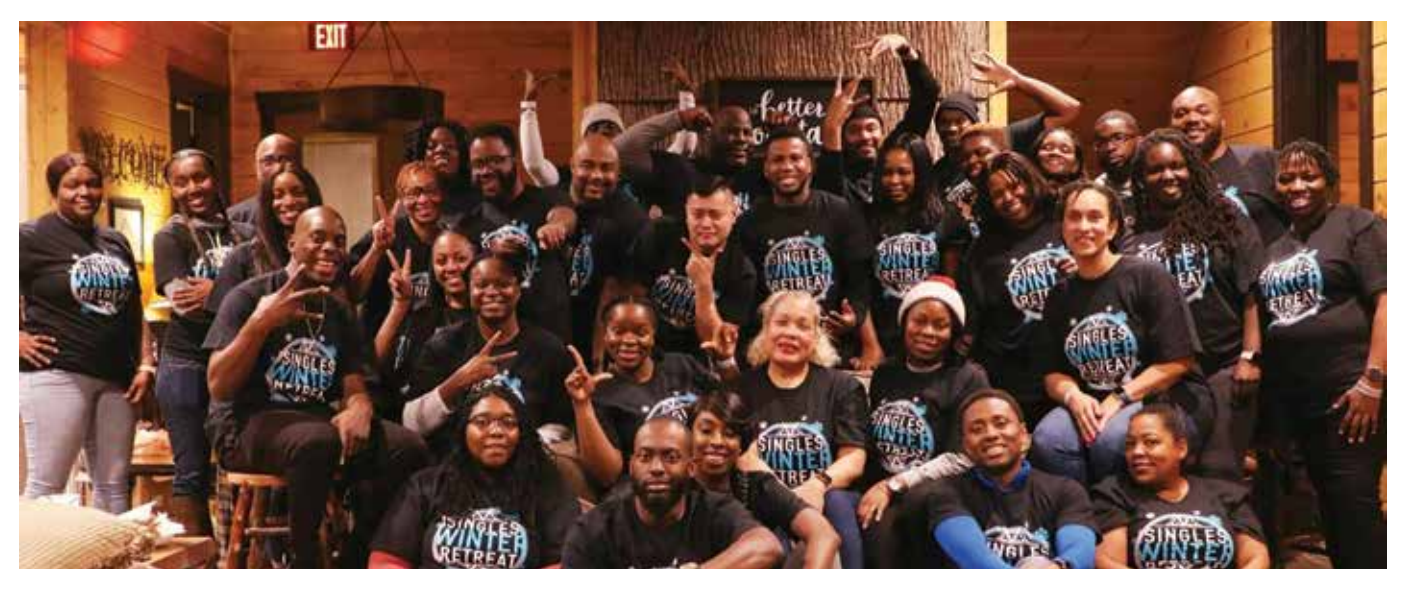
Attendees at the singles' ministries retreat

Singles' Ministries is often viewed as the ministry for young adults, desperate individuals, and undesirables. But, who is Singles' Ministries actually for? What is the purpose of Singles' Ministries? Singles' Ministries is for individuals who are divorced, widowed, single, and interested or uninterested in marriage.