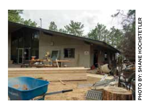
The lodge at Camp Alamisco receives much needed remodeling across two stories on its west side.

project manager. "God always brings the right people for the project." While sitting at lunch, a conversation about needing skilled concrete labor was met with "I know how to do that" from another volunteer seated at the table. The scenarios of personal experience being directly applicable to a project need are a common occurrence on these missions.