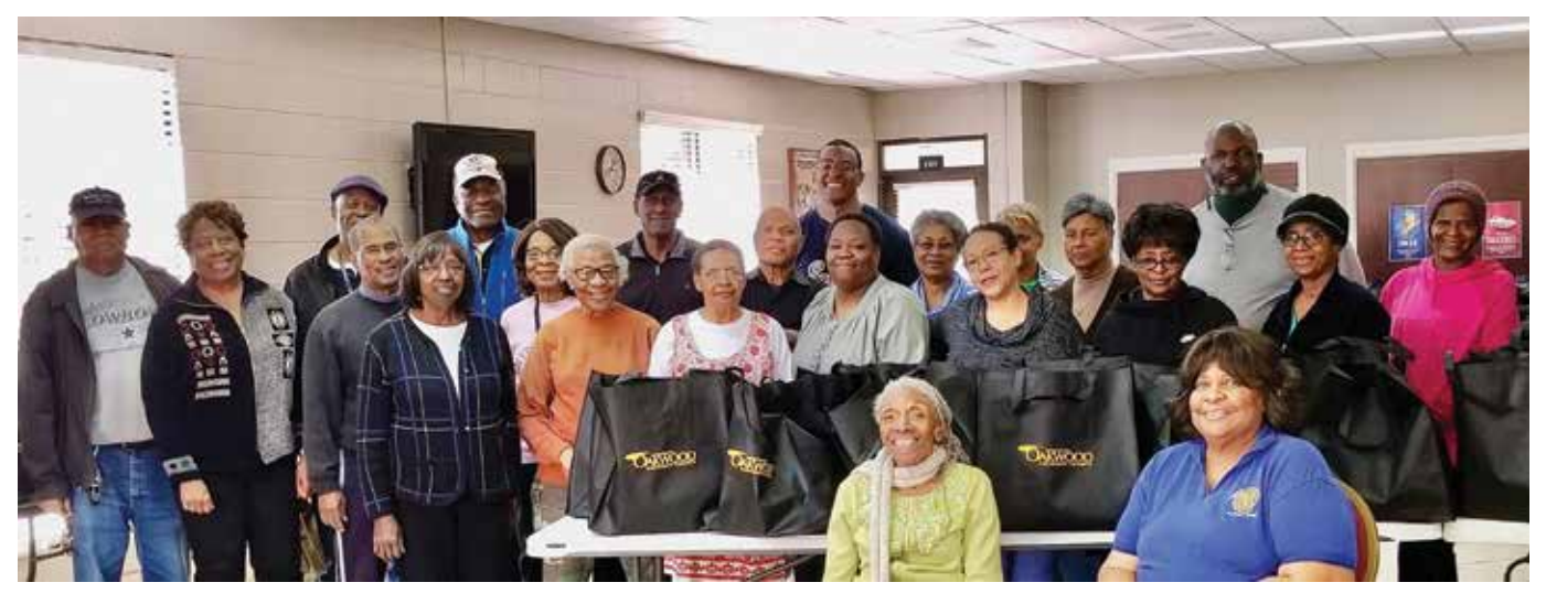
Oakwood University Church members who volunteered to distribute food to the community.

eaven's Storehouse is a food distribution ministry of the Oakwood University Church in Huntsville, Ala. Each year the volunteers make it possible for families to have a Thanksgiving meal.