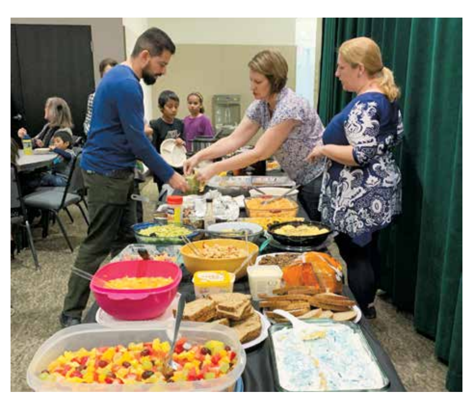
Dishes from around the world complete the bountiful food tables at WholeLife Church in Orlando, Fla., and visitors and members alike are introduced to a buffet comprised of plant-based food.

What's fun about this church? There are so many families who come from dif-