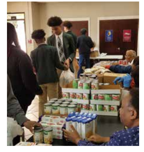
Oakwood Adventist Academy students help fill 260 large bags with food to distribute to the community.

ilies, single-parent families, University students, and those who are a part of the Huntsville homeless community. Recipients also reflect different ethnic groups and individuals over the age of 18.