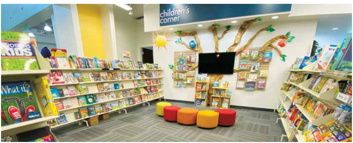
A delightful children's corner carries books for all ages, and provides a space for storytime at the ABC.