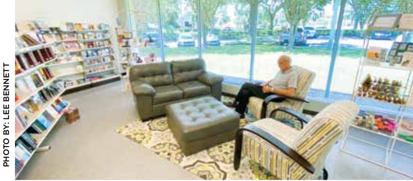
A serene reading and respite area overlooks the spacious lawn at the ABC.