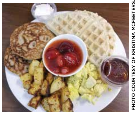
Brunch is served at Kristina's Kitchen. The plant-based restaurant offers a variety of healthy meals, including haystacks, pastas, enchiladas, salads, soups, sandwiches, and veggie burgers. In addition, Kristina's Kitchen also bakes bread, muffins, cookies, granola, and gluten free goodies.

new people are attending Stearns Church on a regular basis, and four individuals have started Bible study for baptism. These new visitors were regular customers at Kristina's Kitchen.