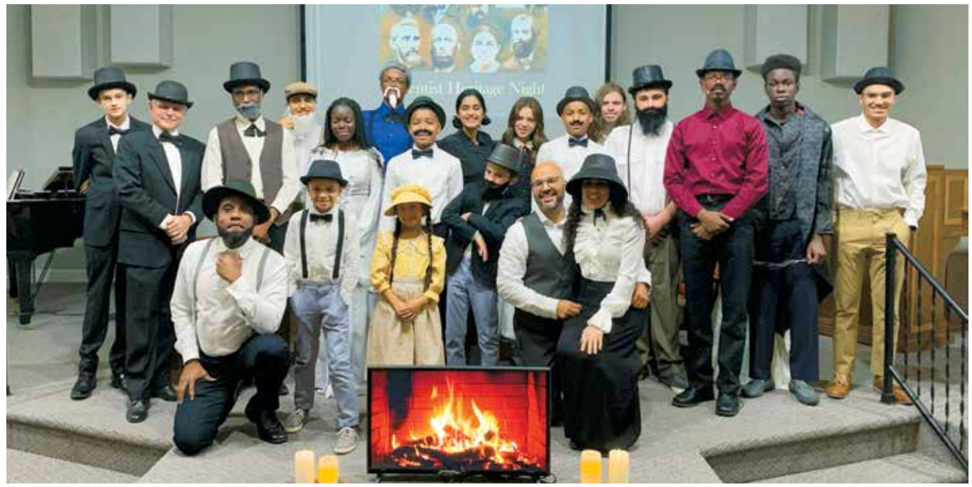
Youth Department members of DeBary-Orange City Church presented a Vesper program on the beginning of the Adventist denomination.

he Youth Department of DeBary-Orange City Church in Fla. portrayed pioneers of the past in an afternoon vesper program in remembrance of October 22, 1844. This day was a date...no, The Date , of a crucial event 177 years ago that has come to define Seventh-day Adventism as not just another church, not just another denomination, but a people specifically fulfilling prophetic destiny.