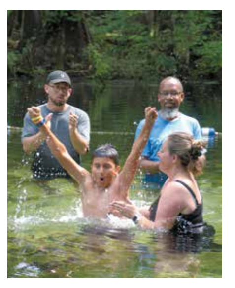
Summer campers at Camp Kulaqua, High Springs, Florida, experience the joy of baptism in God's beautiful spring.

"When the call came, I knew that I loved Jesus and accepted Him as my Savior," said the grandson. "I didn't need to go down front, but something compelled me to go down. As I stood there in front of the pastor, I felt someone take my arm from behind. To my amazement