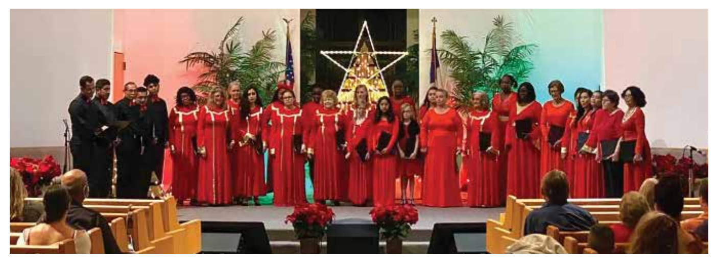
After only three months of working together, the church choir performed several songs at the Christmas program.

ore than 250 people attended the "Light of the World Christmas Concert" held at the Panama City, Fla., Church on December 10, 2021. Including those who watched online, more than 300 people were blessed by the program.